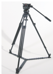
System DV 1