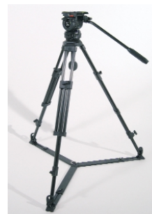
System DV 1 / 2D