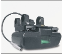
"C" battery mount