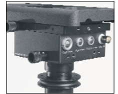
Side-to-side module EFP